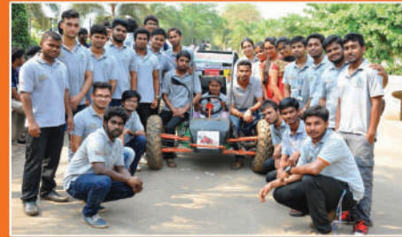
All Terrain Vehicle